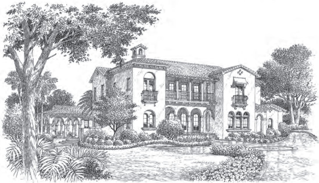
WINTER PARK, FLORIDA