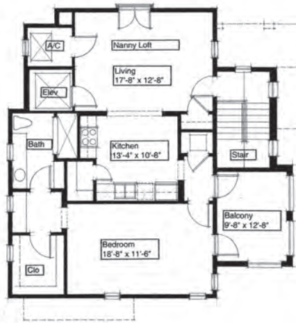
SECOND FLOOR PLAN 1/2" = 1'-0"