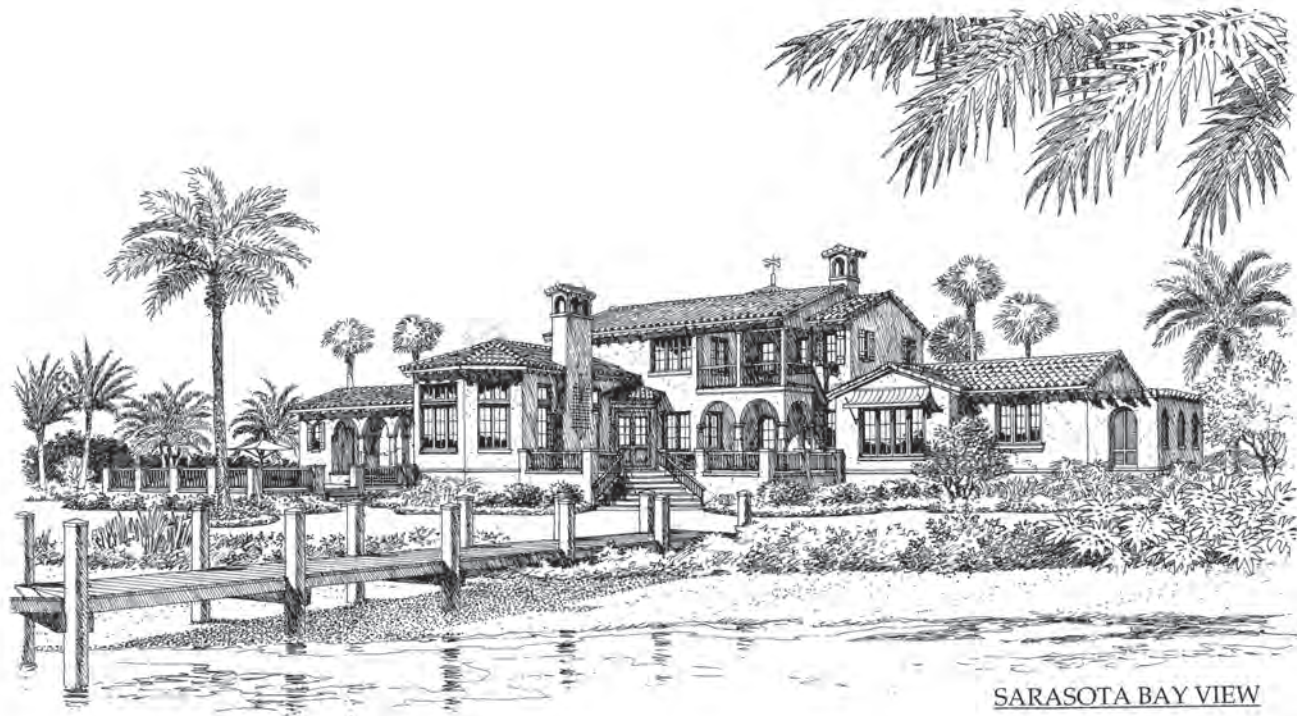
SARASOTA BAY VIEW