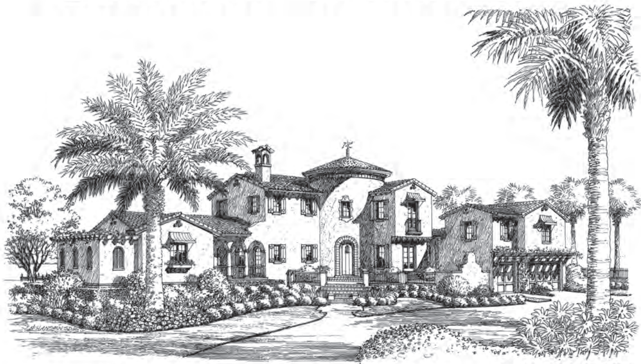
SEAGULL LANE VIEW